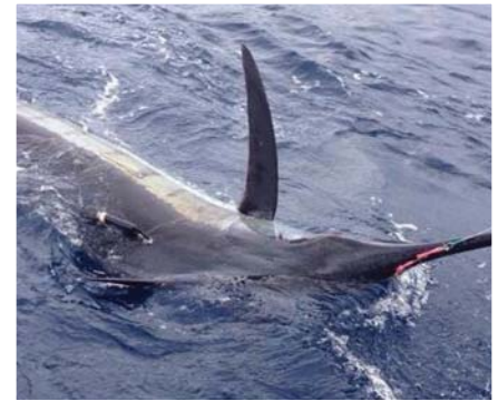
First PSAT IGFA Great Marlin Race tagged blue marlin of the Queensland, Australia Shootout.