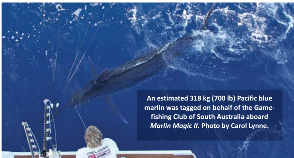
An estimated 318 kg (700 lb) Pacific blue marlin was tagged on behalf of the Game-fishing Club of South Australia aboard Marlin Magic II.

the third tag was deployed on an enormous 318 kg (700 lb) Pacific blue marlin in the week following the tournament! This is the largest marlin successfully tagged in the five-year history of the HIBT Great Marlin Race. As in other IGMR races, the remaining five tags will be deployed in the upcoming weeks as opportunities arise to tag and release marlin.